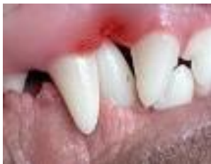
Showing common growth phase of canine teeth

Due to their size, Irish Wolfhound puppies grow rapidly during their first 6 - 12 months of life. This means that their teeth often change position in their mouths. It may seem alarming to see one or both pointed canine teeth in the bottom jaw going either into the gum line or just inside near the pallet. DO NOT BE ALARMED. Until you see soreness or bleeding in the puppy's mouth, you don't need to intervene. Otherwise, wait and be patient because even if the teeth don't align perfectly, in most cases the dog's mouth will accommodate the teeth and won't cause any problems. If you are in any doubt, please go back to your breeder or contact the IWHG for advice and support.