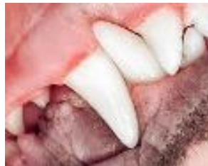
Showing normal teeth position